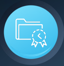
Hierarchical Processing Methodology

To protect that differentiation, we use a combination of Trade Secrets and Patents.