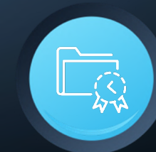
Internal Battery Packaging System for Pole Mounts