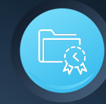
Advanced "Holistic Signature" Based Search